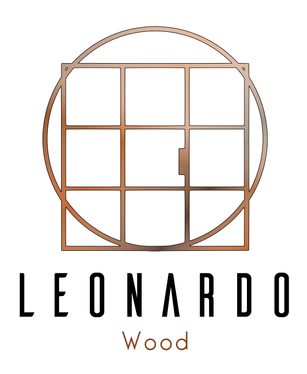
Leo 68 classic